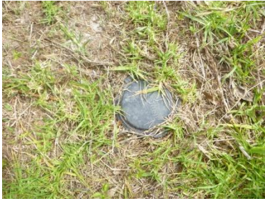
Termite baiting and monitoring stations installed

WARNING: If evidence of drill holes in concrete or brickwork or other signs of a possible previous treatment are reported then the treatment was probably carried out because of an active termite attack. Extensive structural damage may exist in concealed areas. You should have an invasive inspection carried out and have a builder determine the full extent of any damage and the estimated cost of repairs as the damage may only be found when wall linings etc. are removed.